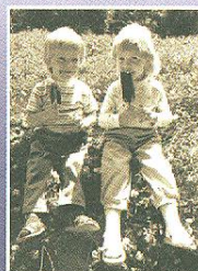
Quarter page ad